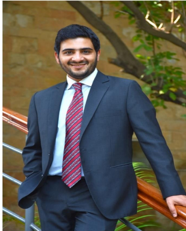
Karvat: New Beginning

In a strategic move, the Karvat Group has taken over the reins of the travel ancillary business, and will hereon steer its business in India with sole proprietorship.